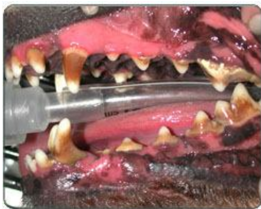
Dog's Teeth Before Dental Cleaning