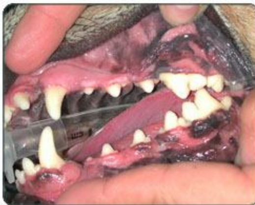
Dog's Teeth After Dental Cleaning